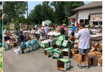
In partnership with Mid Ohio Foodbank

For more information contact St. Vincent Depaul at 380-235-1102